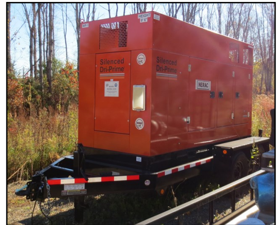
3", 6", and 10" Trash Pumps